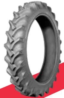
MXR 616 R1