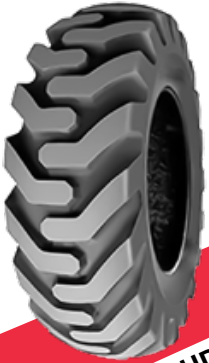
MAX GRADER HD