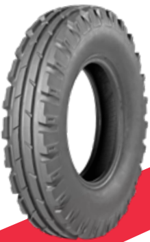
AGRO MAX DR